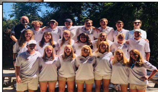
2019 Camp Trinity Staff