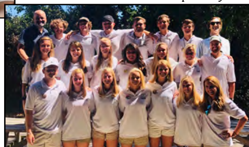
2019 Camp Trinity Staff