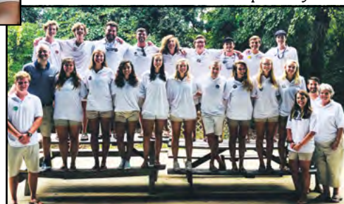
2018 Camp Trinity Staff