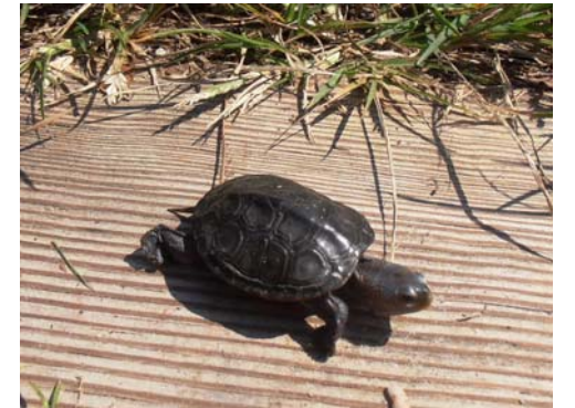
Diamondback Terrapin “Irene” finds a sunny spot to bask.

Subsequently, Sound to Sea students have been finding abundant amounts of life in the pond, the forest, and the sound, especially in the form of mosquito hatchlings around property! The overwhelming amount of wildlife has been a reassuring sign of the resilience of our natural surroundings.