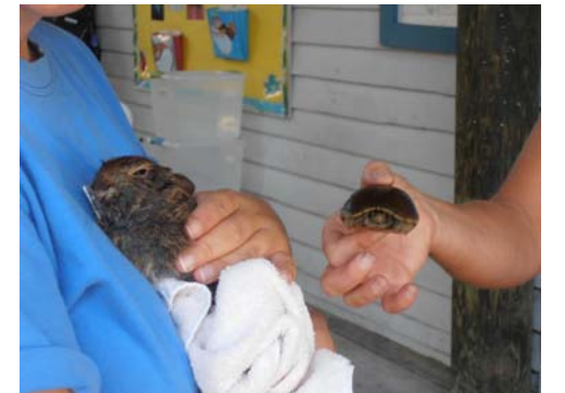
A lucky marsh rabbit drying off after being rescued