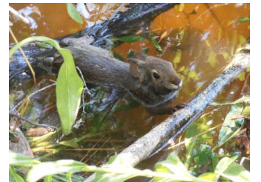
Finally back in his natural habitat!